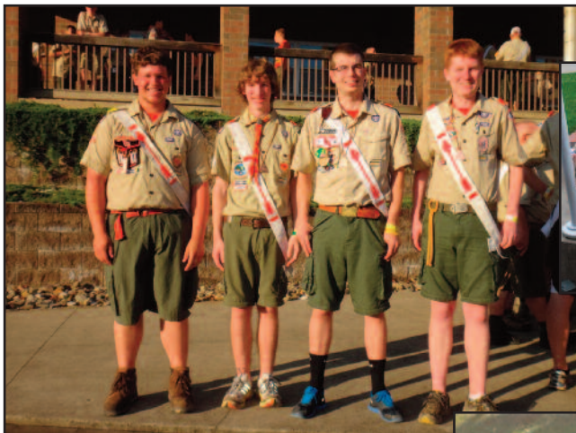
Hetuck Vigil Candidates