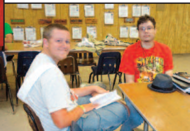
Photos of some of our weekly Callout Team