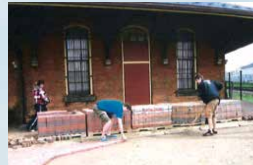
Laying the brick pavers