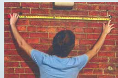
Measuring for the lockable bulletin board installation

The project included renovating a triangular section of land behind the depot building where a ratty crabapple tree stood. Volunteers cut down the tree, removed the stump, put down a layer of sand and laid brick. ORHS plans to place picnic tables in this newly bricked area.