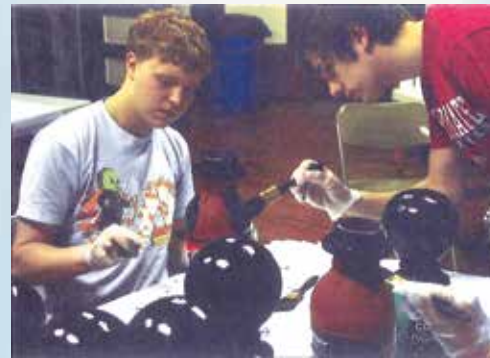
Painting the fence globes

For the third consecutive year, the Buckeye Council float won the grand prize for best overall entry in the Timken Grand Parade, a highlight of the Pro Football Hall of Fame Festival. The trophy will be retired in our name. The float also won a national award for “Best Marketing Campaign” in BSA’s Annual President’s Awards for Marketing Excellence.