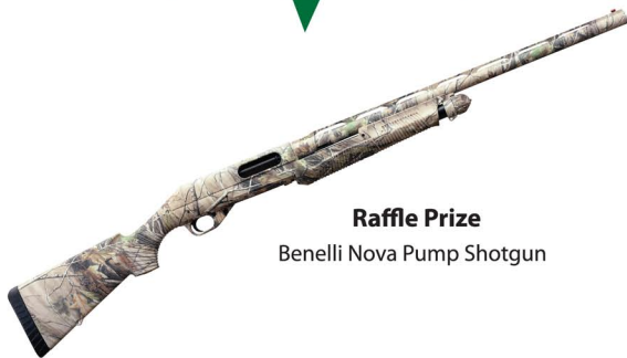
Raffle Prize Benelli Nova Pump Shotgun

Shotgun raffle to benefit the Boy Scout shooting program. Tickets $10.00